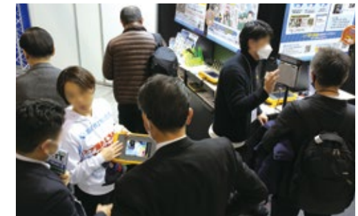
Image reference from SMART ENERGY WEEK 2023