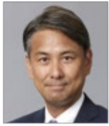
Hiro Inoue Director - General, Energy Conservation and Renewable Energy Department Agency for Natural Resource and Energy Minister of Economy, Trade and Industry (METI)